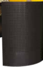
Black Product code: SUNBSU075/125-000299