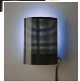
(Shown with translucent glue board)

(Shown with white glue board, see the image on the right for the translucent glue board look)