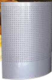
Gray Product code: SUNBSU055/125-000298