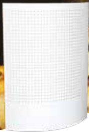
White Product code: SUNBSU015/125-000297