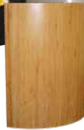
Bamboo (Naturale) Product code: SUNNLE095/125-000304