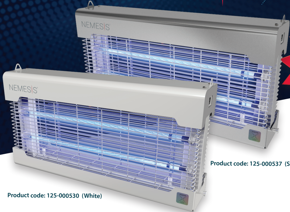
Product code: 125-000530 (White)