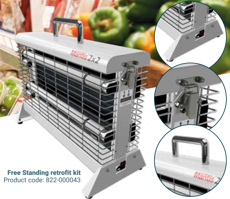
Free Standing retrofit kit Product code: 822-000043