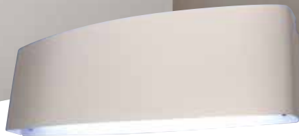
White Product code: 125-000373