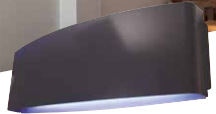
Black Product code: 125-000375